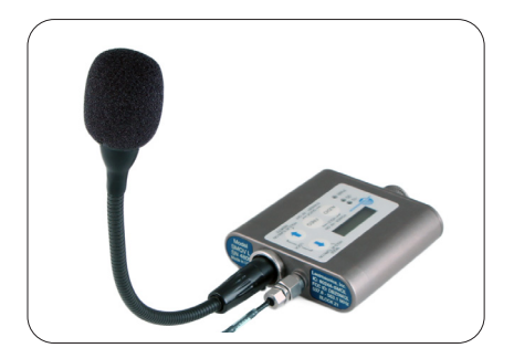
TX-FLEX MINI GOOSENECK OMNI MIC FOR LECTRO | PAGES 3-4