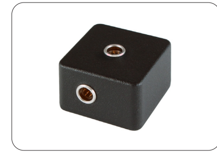
Table and Podium Base for TX-FLEX 6" Mini Gooseneck Omnidirectional Microphone. Simple Plug & Play mini base stand for using TX-FLEX on a podium for press junket etc.. TA5M Input and Output.