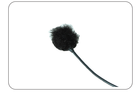
COVERS LAVALIER FUR DISCS | PAGES: 7