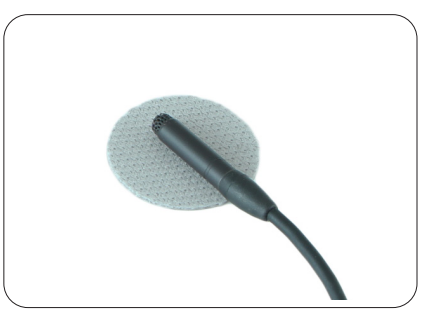
STICKY DISCS | PAGES: 6