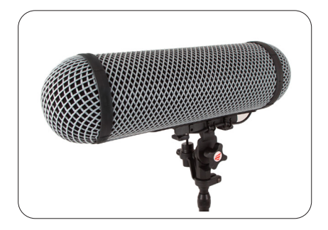
"BLIMP" WINDSHIELDS | PAGES: 10-11