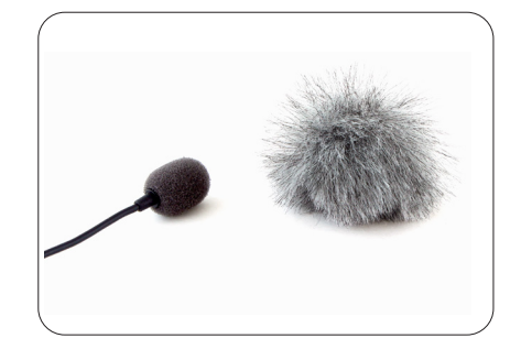
Lavalier Foam & Fur Windshields | Pages: 8