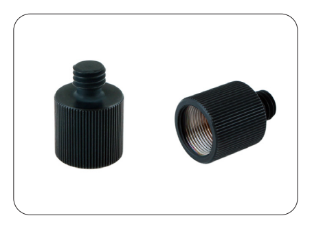
STAND ADAPTOR | PAGE: 9