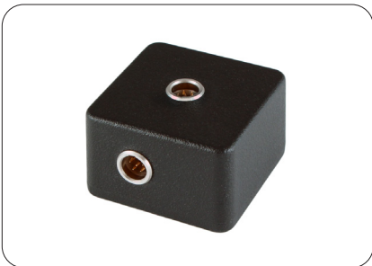
Table and Podium Base for TX-FLEX 6" Mini Gooseneck Omnidirectional Microphone. Simple Plug & Play mini base stand for using TX-FLEX on a podium for press junket, as a "Plant mic" etc.. TA5M Input and Output.