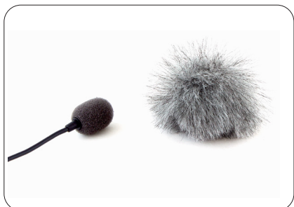
LAVALIER FOAM & FUR WINDSHIELDS | PAGES: 8