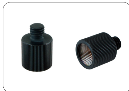
STAND ADAPTOR | PAGE: 9