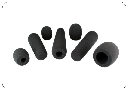
FOAM WINDSCREENS | PAGE: 5