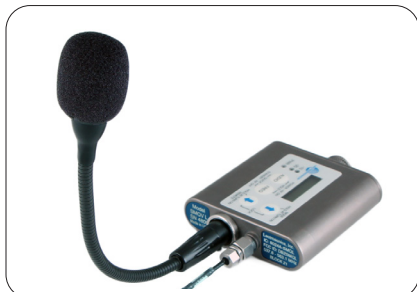
TX-FLEX Mini GOOSENECK OMNI MIC FOR LECTRO | PAGES 3-4