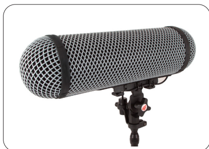
"BLIMP" WINDSHIELDS | PAGES: 10-11