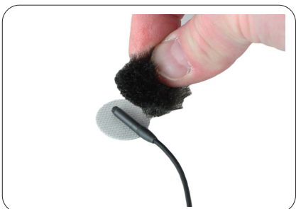
COVERS LAVALIER FUR DISCS | PAGES: 7