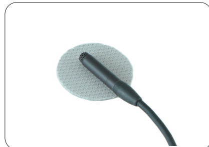
STICKY DISCS | PAGES: 6